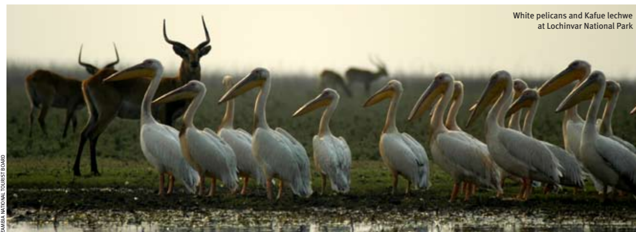
White pelicans and Kafue lechwe at Lochinvar National Park

National parks are administered by the Zambia Wildlife Authority. Most are surrounded by large Game Management Areas (GMAs), which contain local communities. GMAs are designed to provide a buffer between the pristine national park and the developed land beyond. In theory they offer the same habitat and ecosystem as the park, but in practice there is usually less wildlife due to illegal hunting and pressure for land. Conservation projects aim to reverse this trend by regenerating game resources and helping communities live sustainably. Controlled hunting is permitted in GMAs but not in national parks.