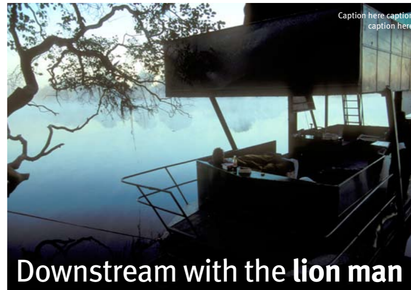
Caption here caption here